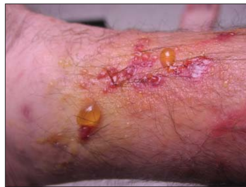
Figure 1. Symptoms caused by poison ivy.