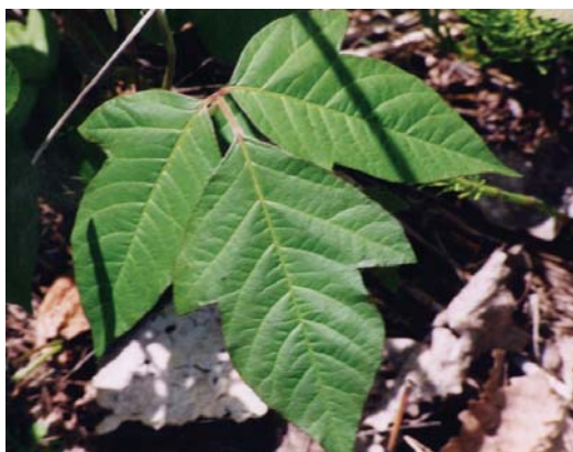
Figure 2. Leaves of poison ivy.

Julie told herself that she had better learn to recognize the plant because she did not plan on staying in her room for the rest of her life!