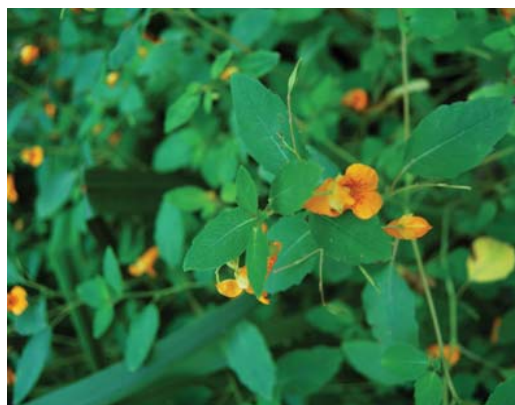
Figure 3. Jewelweed.

Your job is to use the scientific method to plan an experiment to determine if jewelweed is an effective treatment.